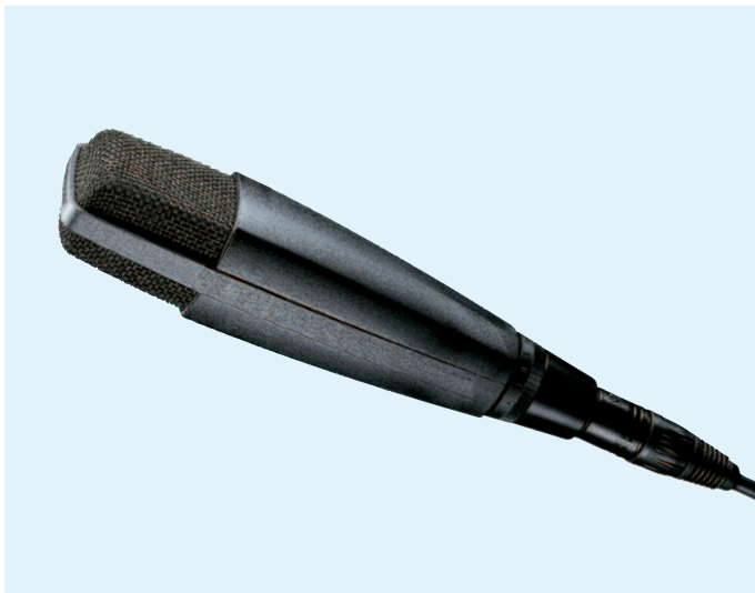
Cable pictured is an accessory not supplied with the microphone

The MD 421 II is one of the best known microphones in the world. Its excellent sound qualities enable it to cope with the most diverse recording conditions and broadcasting applications. The five position bass control enhances its 'all-round' qualities. Colour: black.