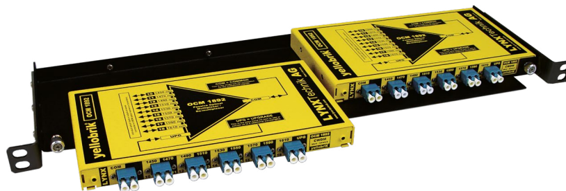
Optional RFR 1018 ½RU 19" Rack chassis with 2 x OCM modules