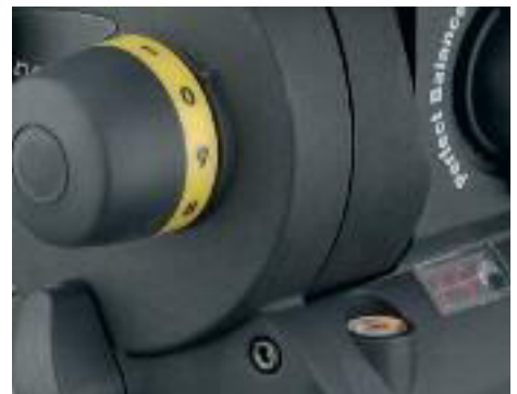
Above: Digital balance read out for quick set up with multiple cameras

Combining Vinten's unique combination of Perfect Balance with the patented, infinite control TF drag system (see page 27), the Vision 100 works exactly in tune with you for uncompromising camera control.