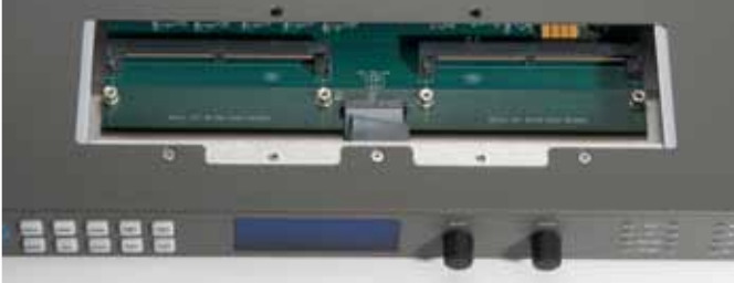
FS2 Expansion Bay for Option Modules