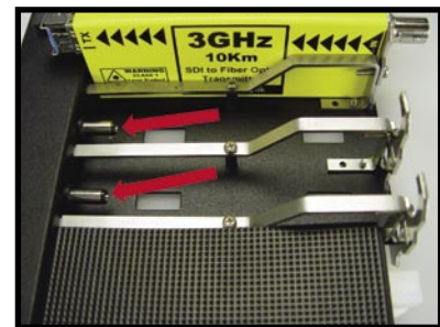
Power connectors on integrated power bus