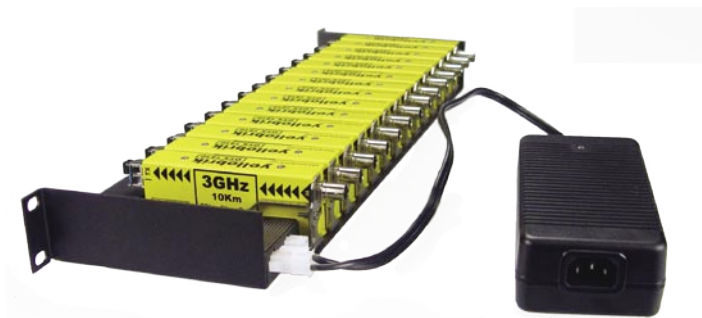
Rear of rack frame showing power connectors and one optional external power brick (use second brick for redundant protection)