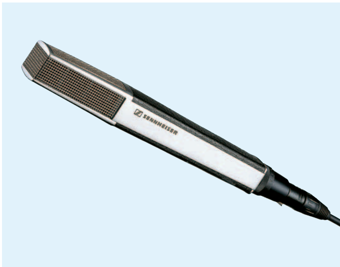
Cable pictured is an accessory not supplied with the microphone

The MD 441 U is a microphone of exceptional quality: its acoustic properties come as close as possible to those of a condenser microphone. Accurate signal response and low distortion are ensured, even with the highest sound pressure levels. Surface: all metal body with black leatherette finish, sound inlet basket: nickel plated.