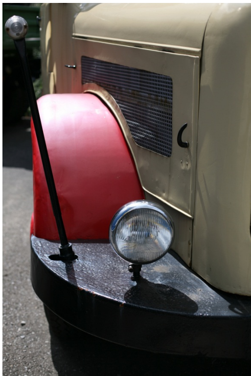
Without ZEISS T* POL Filter

Circular POL Filters avoid problems with exposure metering and AF systems of (D)SLR camera bodies that might occur with linear POL filters.