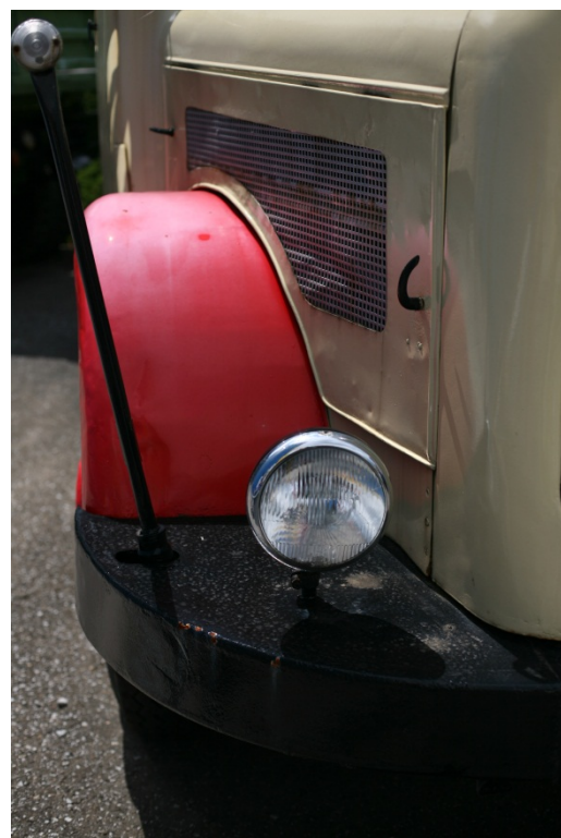
With ZEISS T* POL Filter