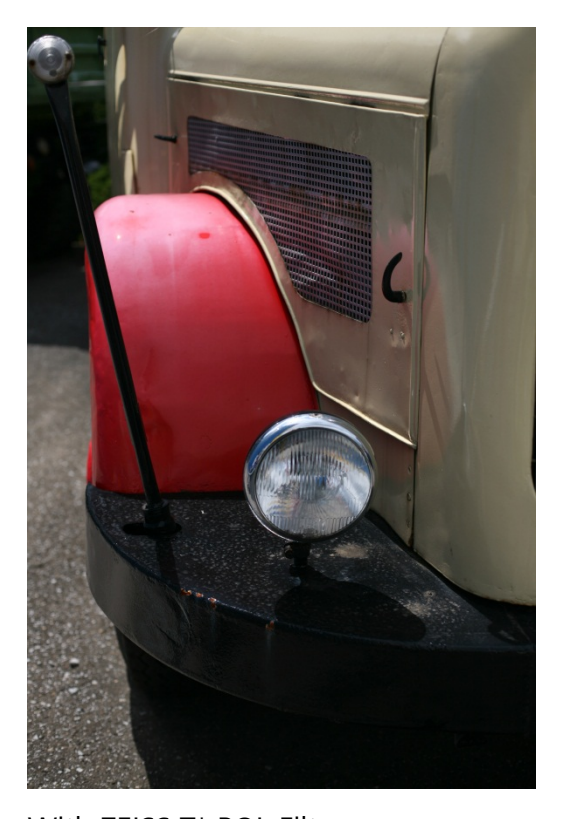
With ZEISS T* POL Filter