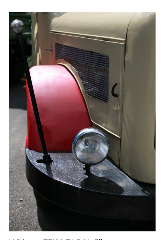
Without ZEISS T* POL Filter

Circular POL Filters avoid problems with exposure metering and AF systems of (D)SLR camera bodies that might occur with linear POL filters.