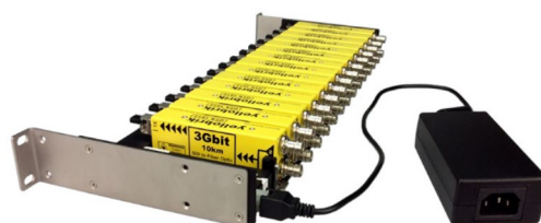
Rear of rack frame showing power connectors and one optional external power brick (use second brick for redundant protection)