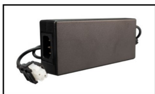
RPS A100: 100W Power supply