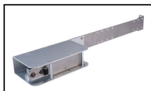
RXT 1001: Power Supply Holder