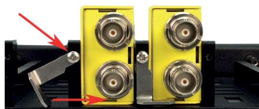
Modules are clamped securely into position